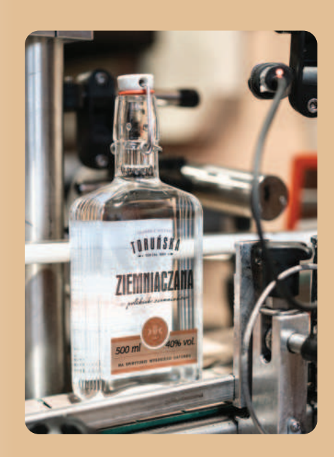
With the help of Master Designers and our Graphic Team we design and print labels and stick them to bottles.