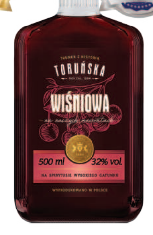
TORUNSKA CHERRY SPIRIT DRINK