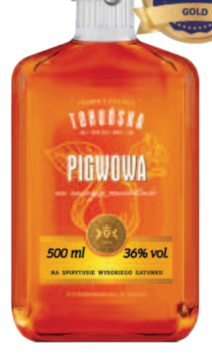
TORUNSKA QUINCE LIQUEUR