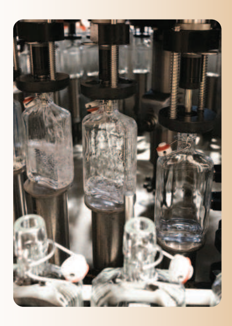
We develop our own recipes, based on natural ingredients, and bottle straight vodkas, flavored vodkas, liqueurs and high-quality spirits.