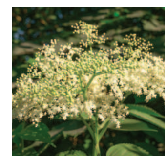
ELDERFLOWER 22% / 26% VOL.