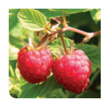
RASPBERRY 32% VOL.