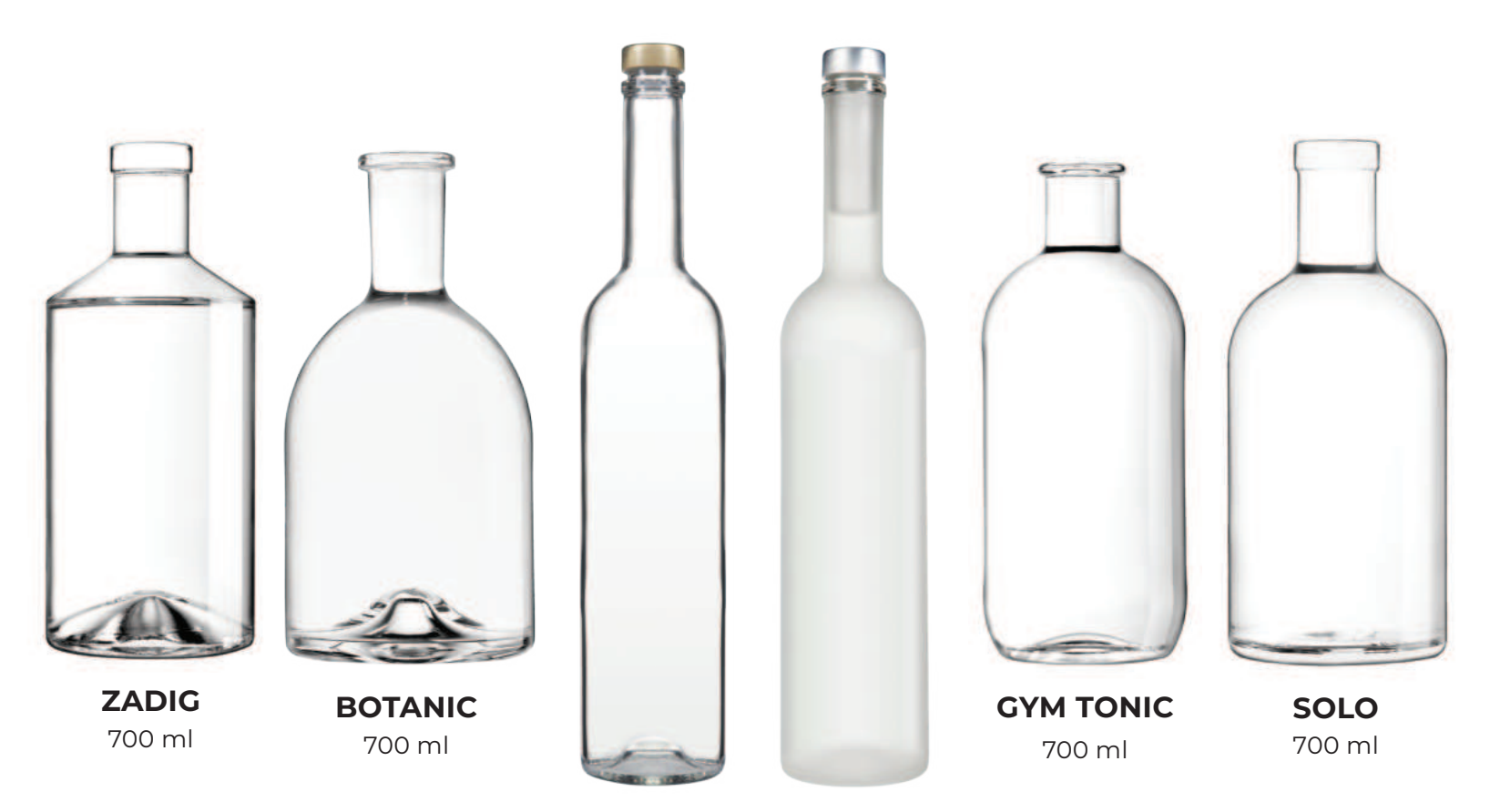
FUTURA 700 ml