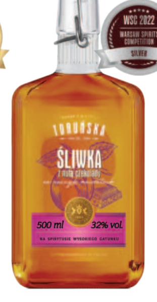
TORUNSKA PLUM WITH CHOCOLATE LIQUEUR