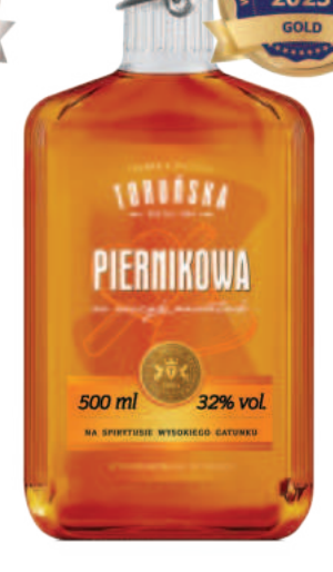
TORUNSKA GINGERBREAD LIQUEUR