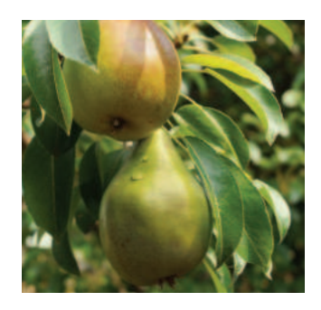
PEAR 37,5% / 40% VOL.