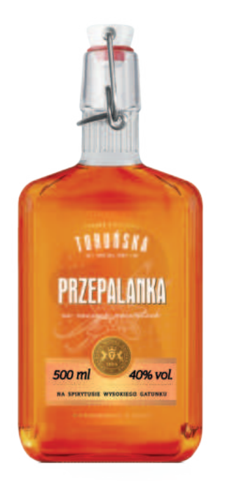
TORUNSKA CARAMEL VODKA