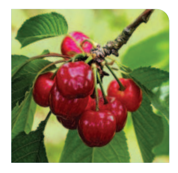
CHERRY 32% VOL.