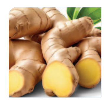
GINGER 22% / 26% VOL.