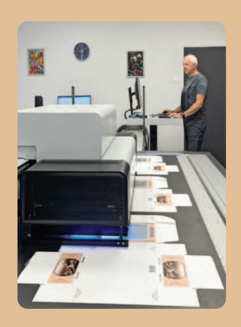
We offer our clients personalized packaging with full printing on a professional UV printer